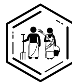
Culture and Food Traditions