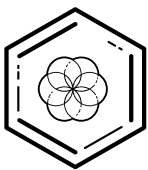
Co-creation and Sharing of Knowledge