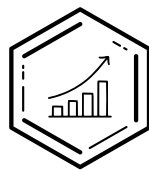
Circular and Solidarity Economy