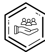
Human and Social Values